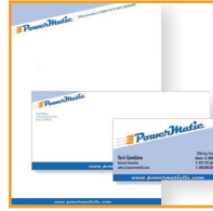
STATIONERY, BUSINESS CARDS