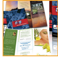
BROCHURES & FLYERS