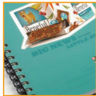
JOURNALS, BOOKS & BINDERS