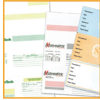
CHECKS, INVOICES & FORMS