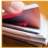
CATALOGS & FOLDERS