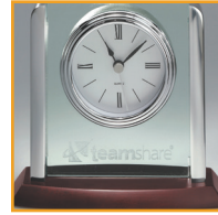
DESK & OFFICE ACCESSORIES