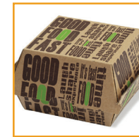
FOOD STORAGE PACKAGING