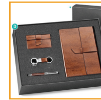
MULTIPLE COMPONENT PACKAGING