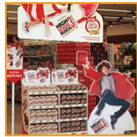
POINT OF PURCHASE DISPLAYS