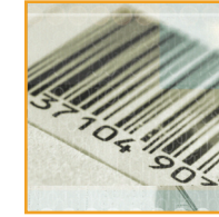
FULFILLMENT AND KITTING