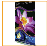
SIGNAGE & POSTERS