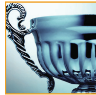
RECOGNITION & AWARDS