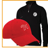
APPAREL & UNIFORMS