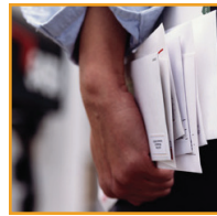
DIRECT MAIL PROGRAMS