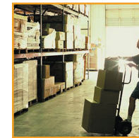
WAREHOUSING AND FULFILLMENT