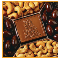
FOOD & EXECUTIVE GIFTS